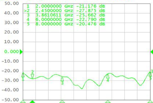
Tr3 S21 Log Mag 10.00dB/ Ref 0.000dB [F2 Smo]