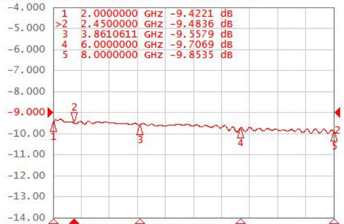
Tr2 S21 Log Mag 1.000dB/ Ref -9.000dB [F2]