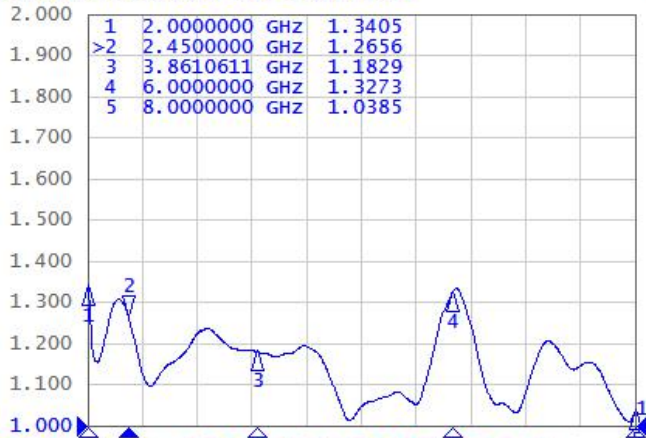
Tr1 S11 SWR 100.0m/ Ref 1.000 [F2]